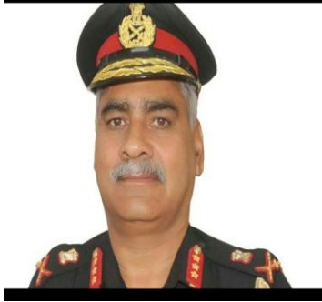
DG NCC (DIRECTOR GENERAL OF NCC)

Aur Masjid Bhi Hai Yahan, Girija Ka Hai Ghadiyaal Kahin, Mullah ki Kahin Hai Ajaan, Ek Hee Apna Ram Hain, Ek hi Allah Taala Hai, Ek Hee Allah Taala Hain, Range Birange Deepak Hain Hum, lekin Jagmag Ek Hai, Ha Ha Ha Ek Hai, Ho Ho Ho Ek Hai. Hum Sab Bharatiya Hain, Hum Sab Bharatiya Hain.