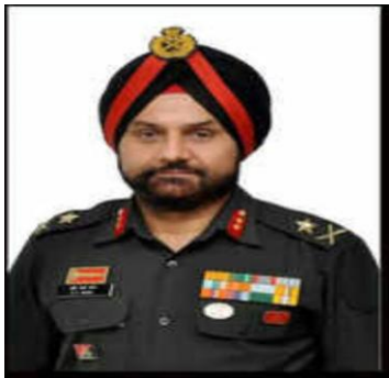
ADG OF NCC (P, H, HP, CHD) DTE