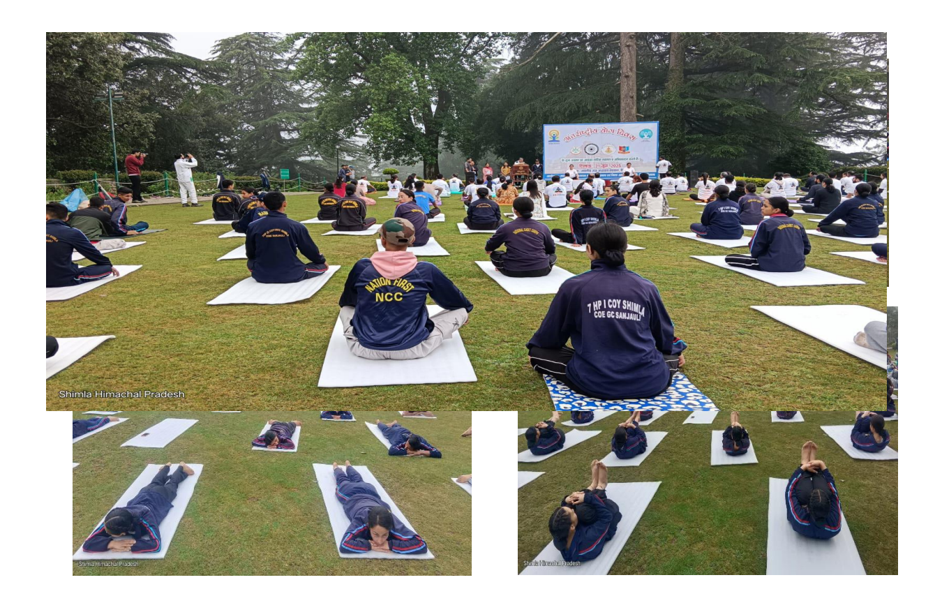
The event ended with refreshments for the cadets as well as for the participants with a lifetimes memories to cherish.