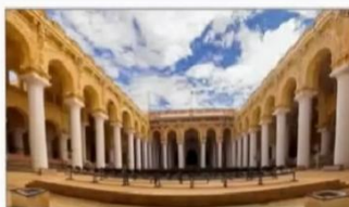
THIRUMALAI NAYAKKAR MAHAL