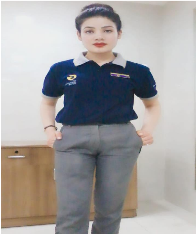
INFOCITY CLUB GUJRAT OJT TRAINING