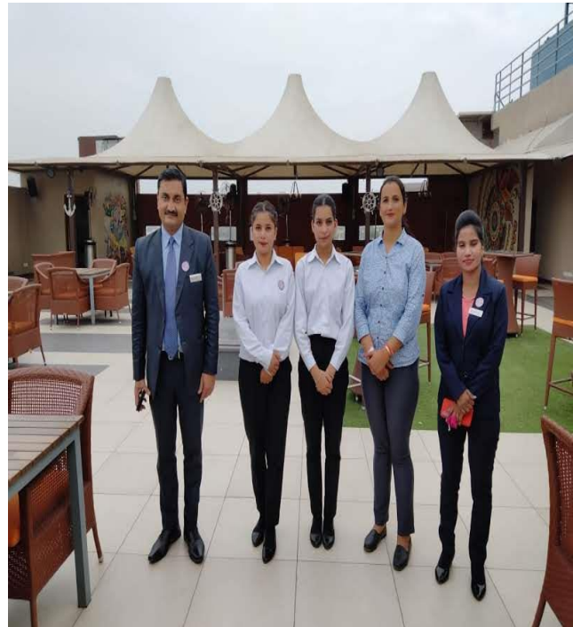
HOTEL REGENTA CASSIA ZIRAKPUR