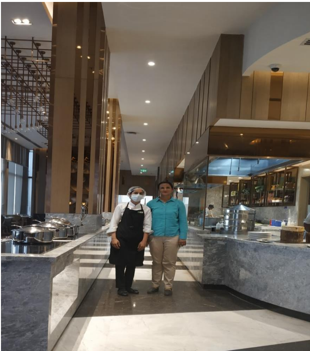
HOTEL HOLIDAY INN ZIRAKPUR