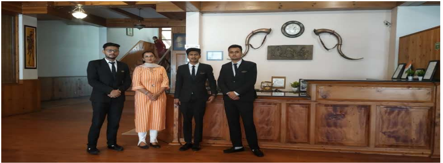
HOTEL J.J.VIVAN KULLU OJT TRAINING