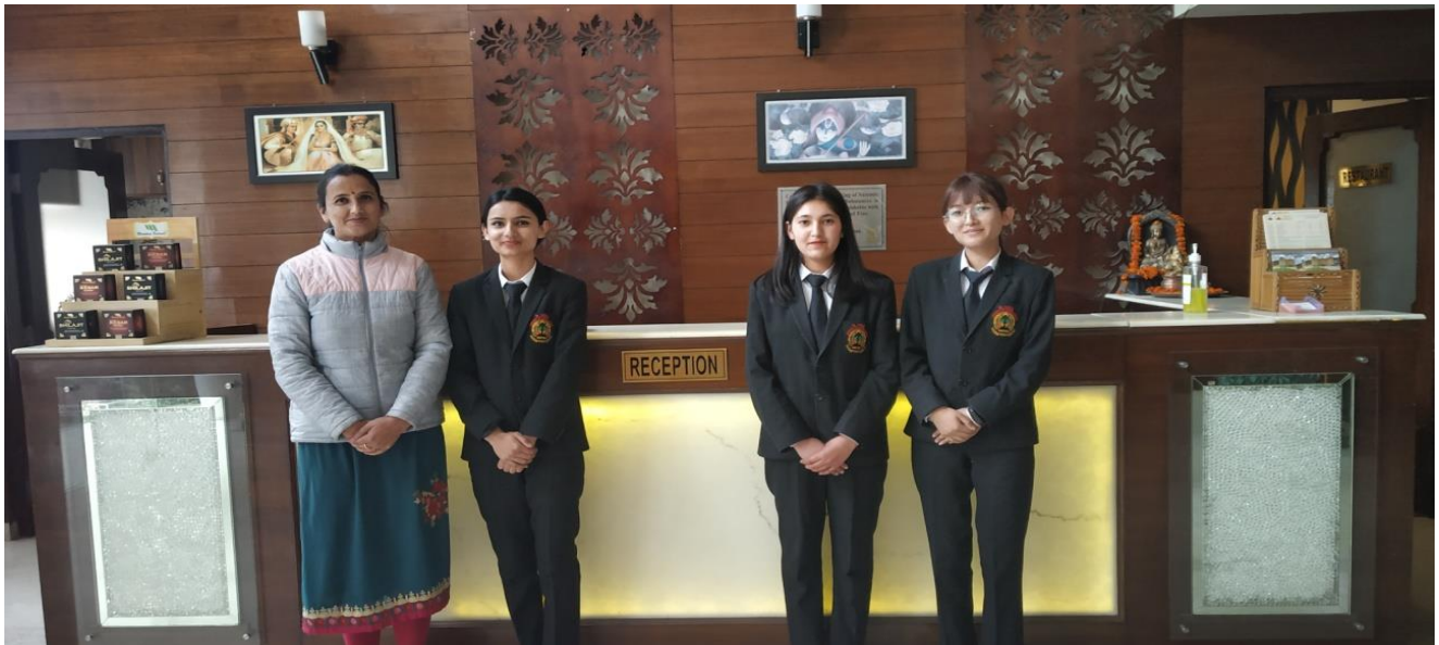
HOTEL MAPPLE RETRET MANALI