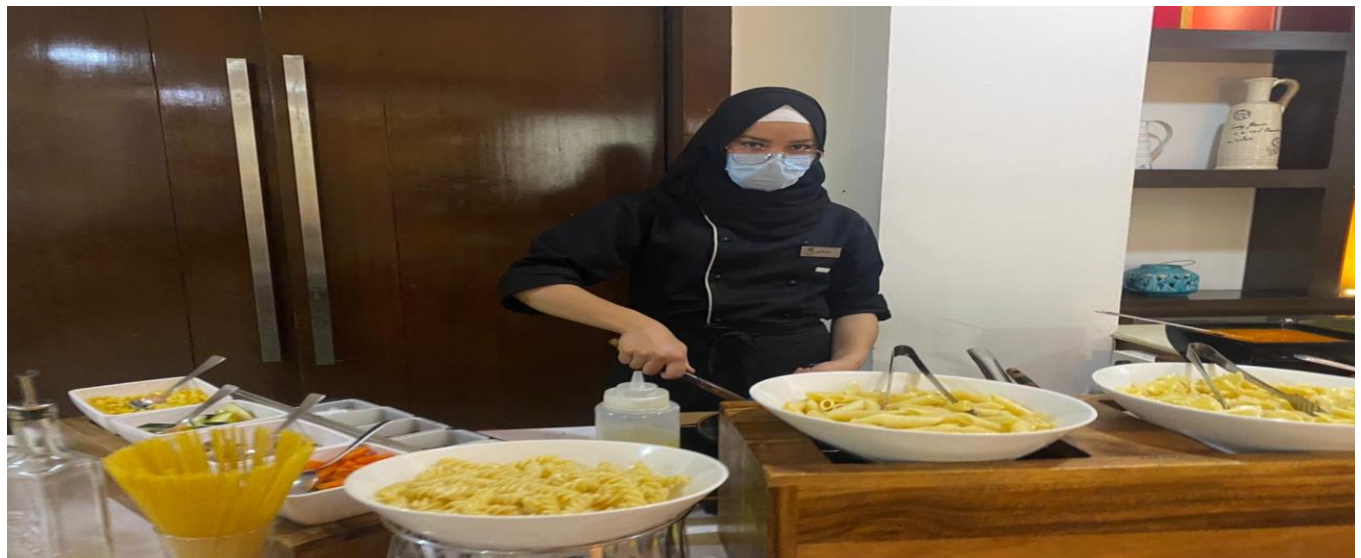
GLENVIEW RESORT KASALI