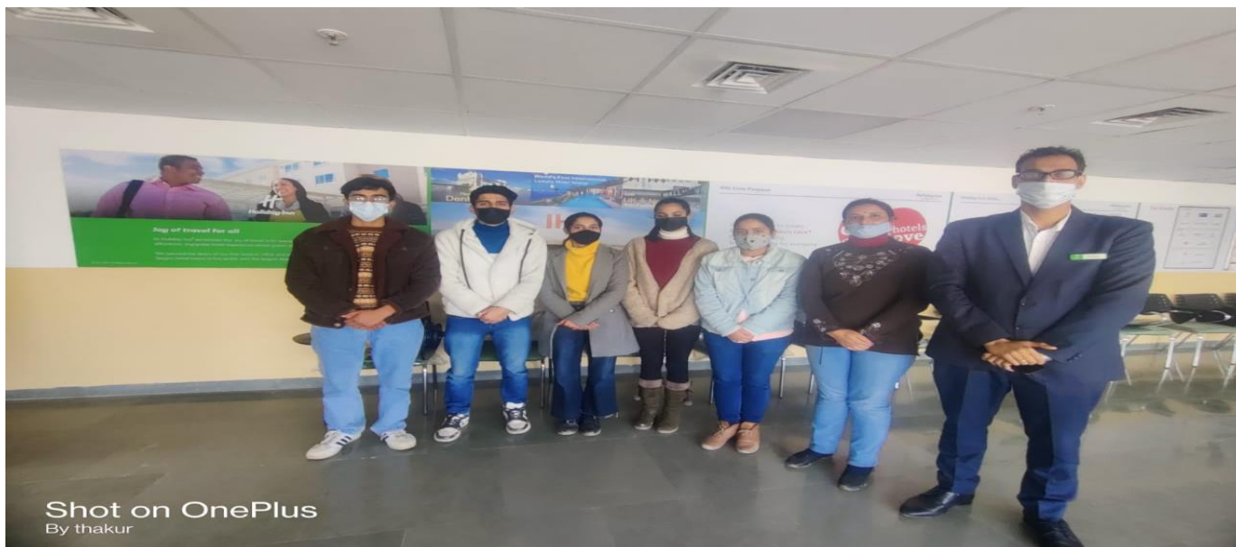
HOLIDAY INN ZIRAKPUR INDUCTION MEETING