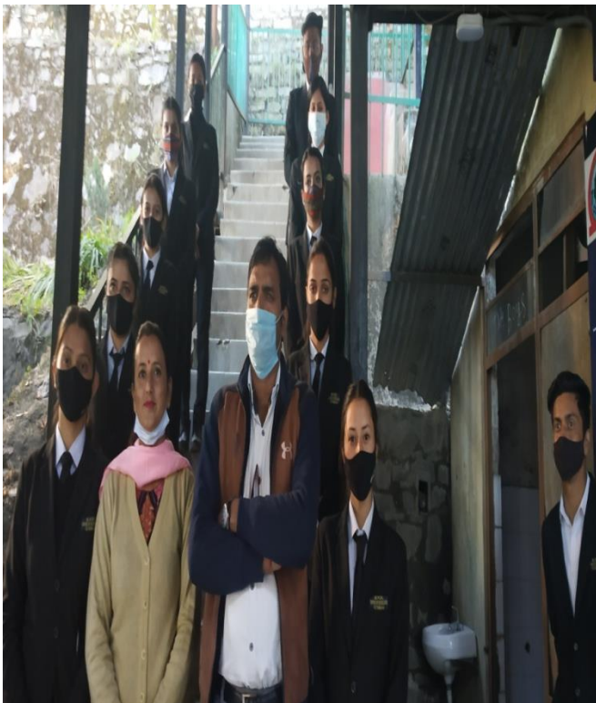
SKILL EXAMINATION 2022