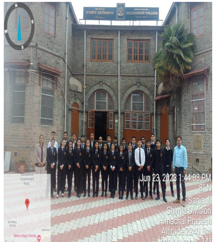
SKILL EXAMINATION 2023