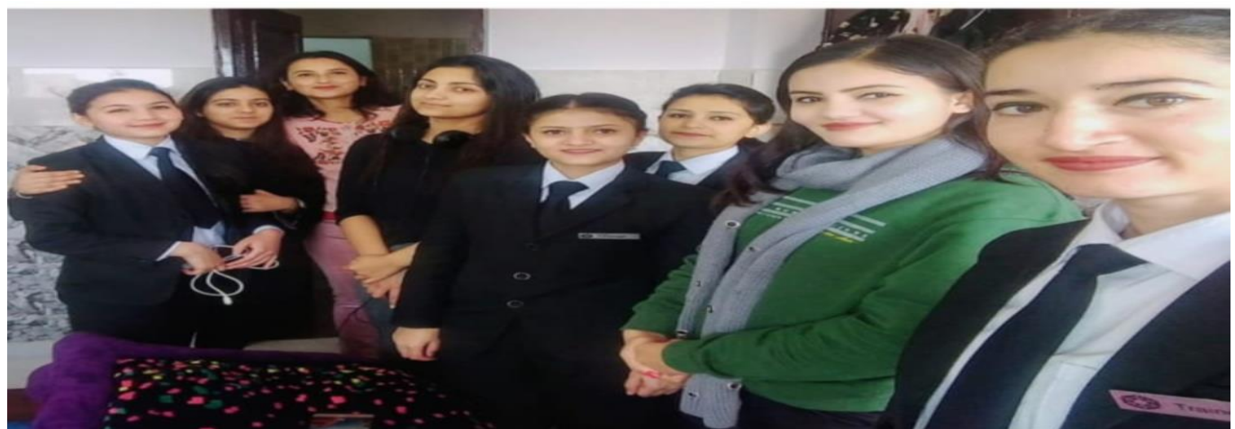
TAJ CHANDIGARH OJT TRAINING 2018