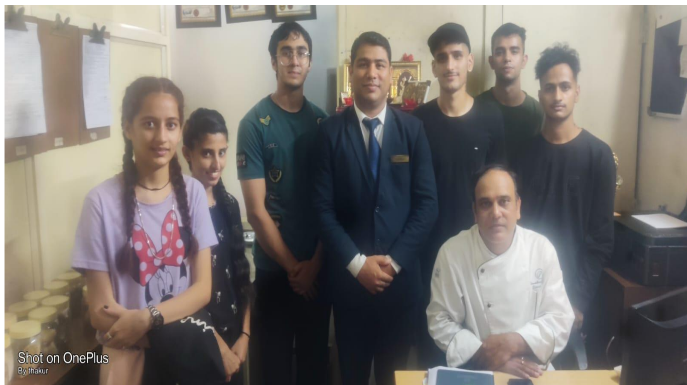
HOTEL OCEAN PEARL MANGLORE, GROUP OF SAGAR RATNA